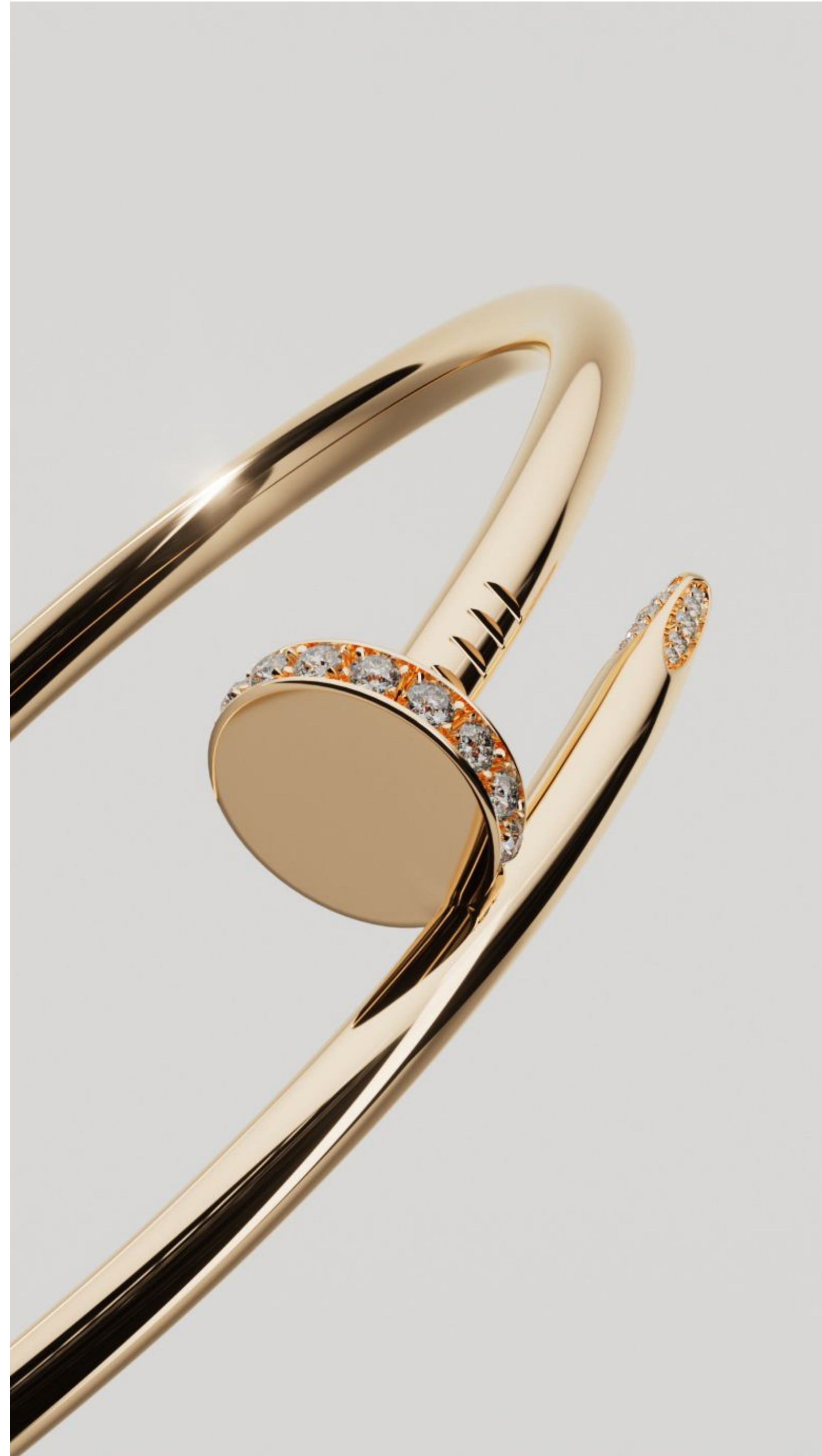
Fashionfile A/W 2022