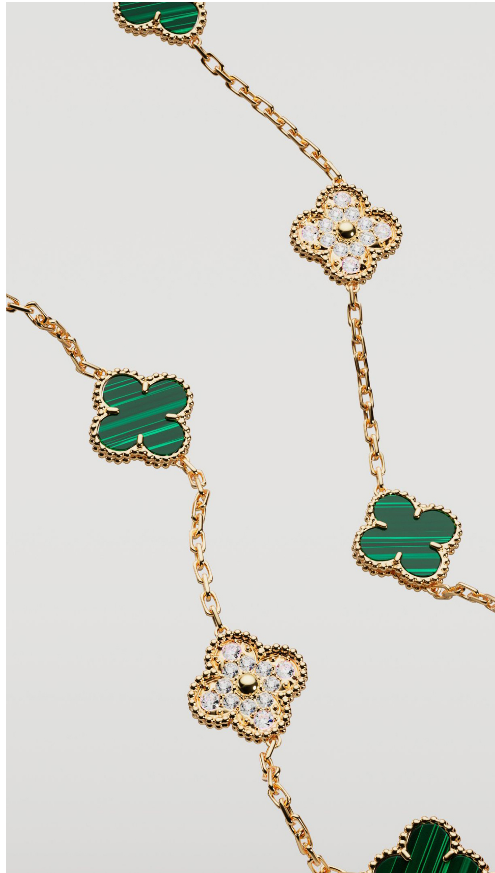
Fashionfile A/W 2022